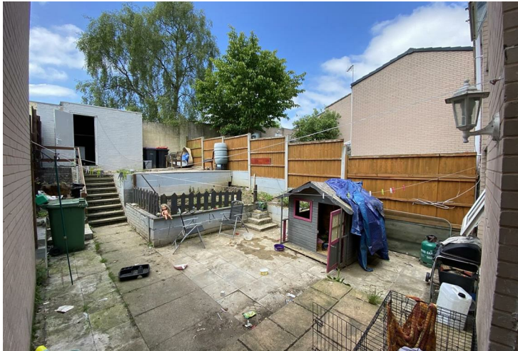
Rear garden leading to single garage